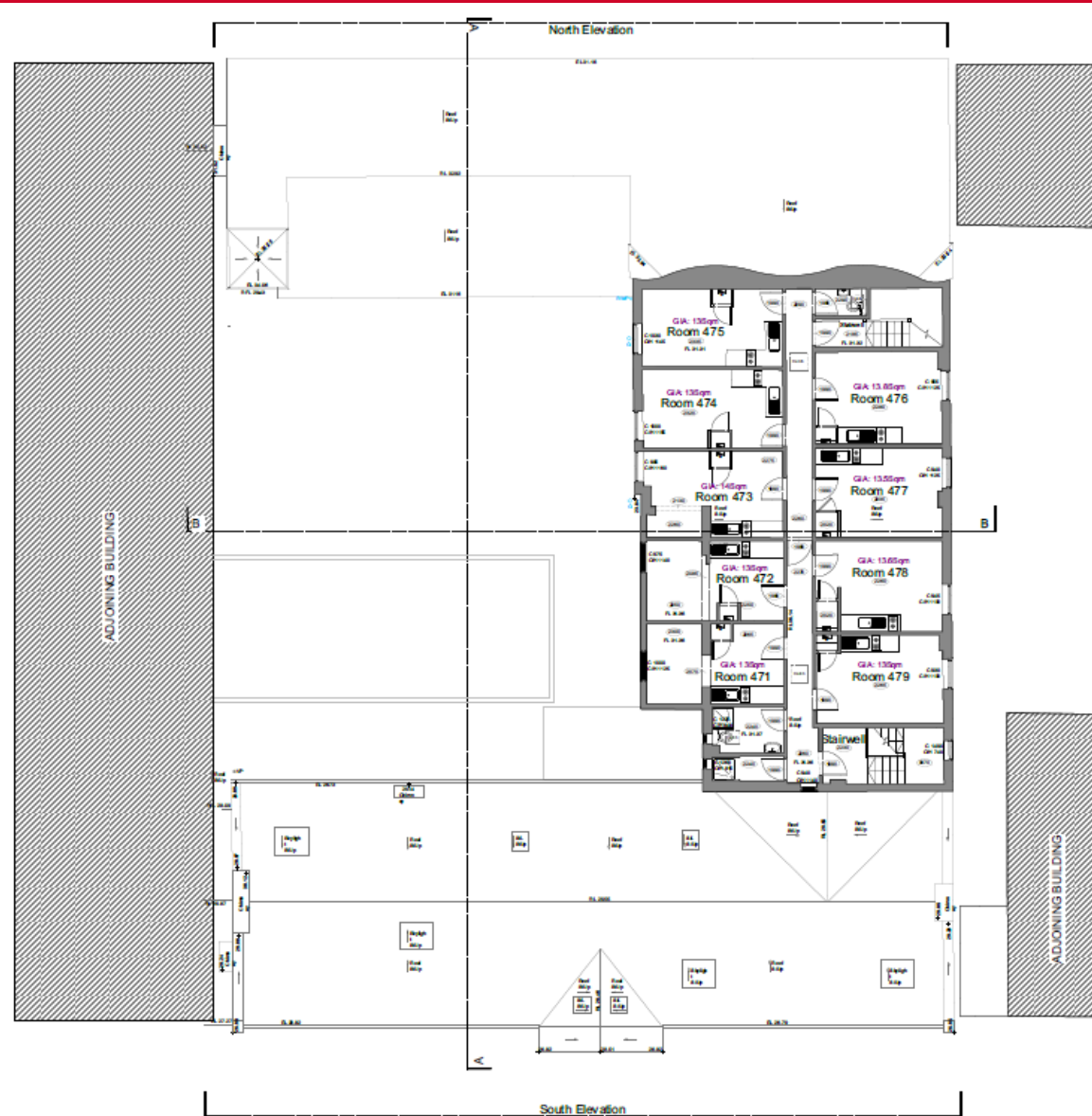
Proposed Fourth Floor Plan